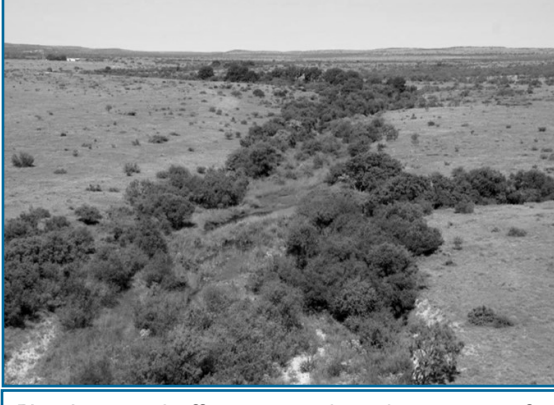
Riparian area buffer zones reduce the amount of sediment that enters streams. They also benefit wildlife by providing food, cover, travel corridors, and nesting sites.

Texas A&M Forest Service, in cooperation with Texas State Soil and Water Conservation Board and numerous natural resource partners, develops and periodically updates BMP guidelines, and provides education, outreach, and training on their application.